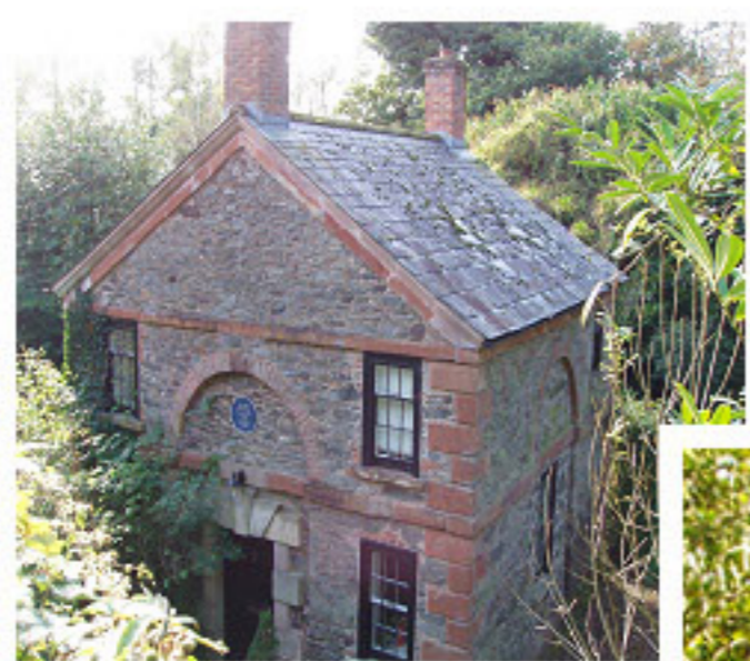
Lock Keeper's House Lock No 6