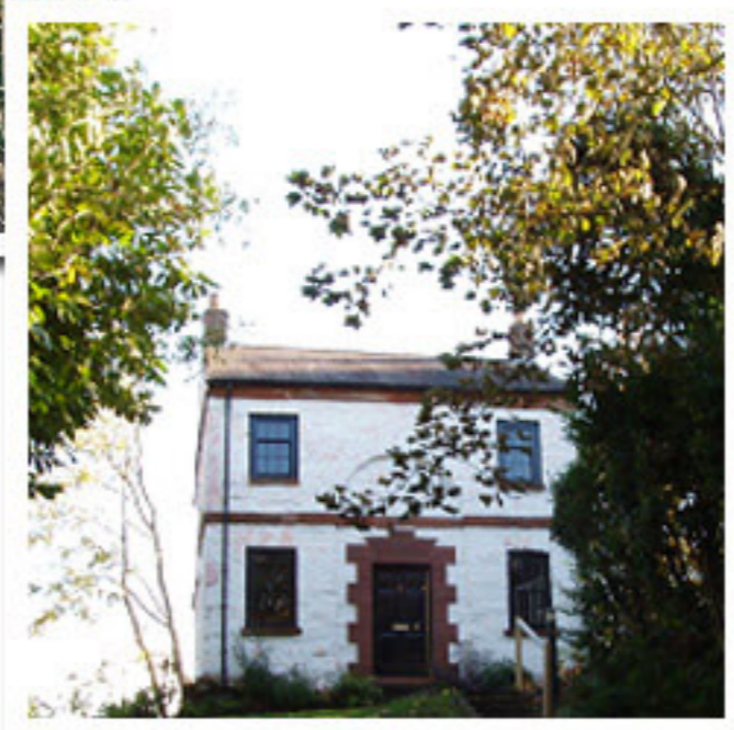
Lock Keeper's House Lock No 8